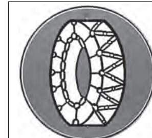
Snow chains required road sign

Drivers who are unsure about winter tire requirements can contact their local vehicle registration or safety office.