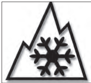
Three-mountain tire logo

While the law does not mandate calendar dates during which snow tires are required, German drivers often use the helpful rule of thumb "from O to O," meaning snow tires should be put on in October and remain on until Ostern (Easter).