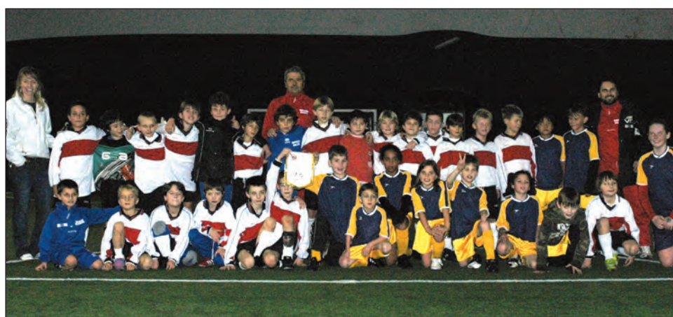
The CYSS EDGE! Bambini's soccer team poses with players from a Sovizzo team after playing a friendly match Nov. 22 in Sovizzo.