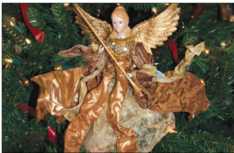
Local Christmas markets offer unique gifts and decorations, music and entertainment, and regional delicacies. Local cities near Camp Darby also feature living nativity scenes.

Camp Darby Installation Tours and Registration has scheduled a shopping trip to the Pisa Market on Sunday and is offering a chance for some last minute shopping at the Vicenza Post Exchange on Dec. 18.