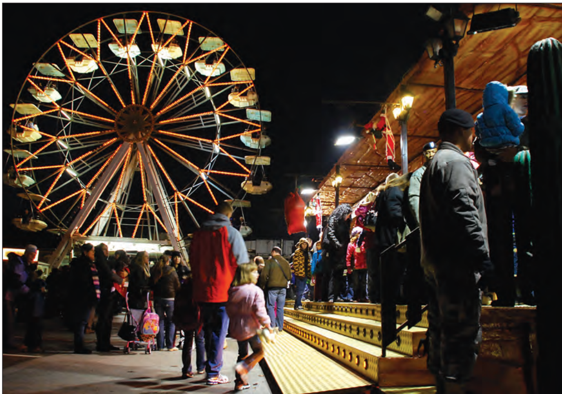
Community members check out the rides at the Holiday Festival Friday in the Post Theater parking lot.